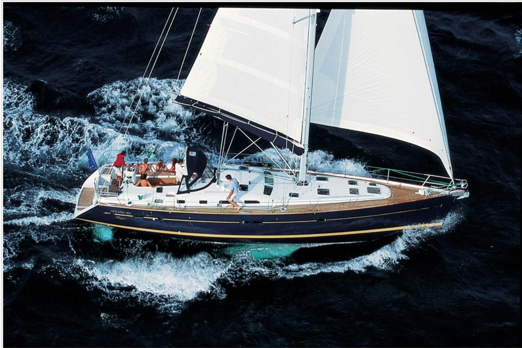
Beneteau Oceanis 523