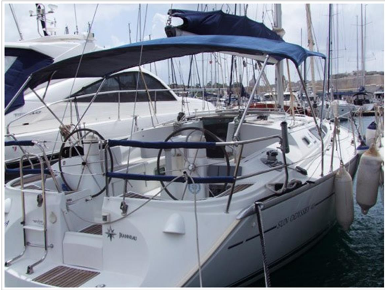
Jeanneau Sun Odyssey 40