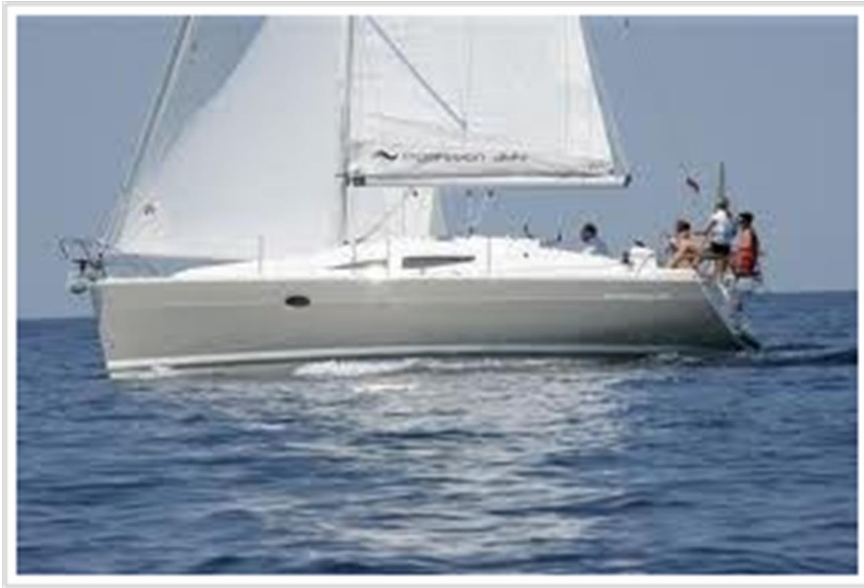
Elan Line 344 Impression